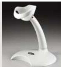
> AS-8000 stand