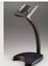
> AS-8120 stand