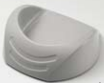
> AS-8000 holder